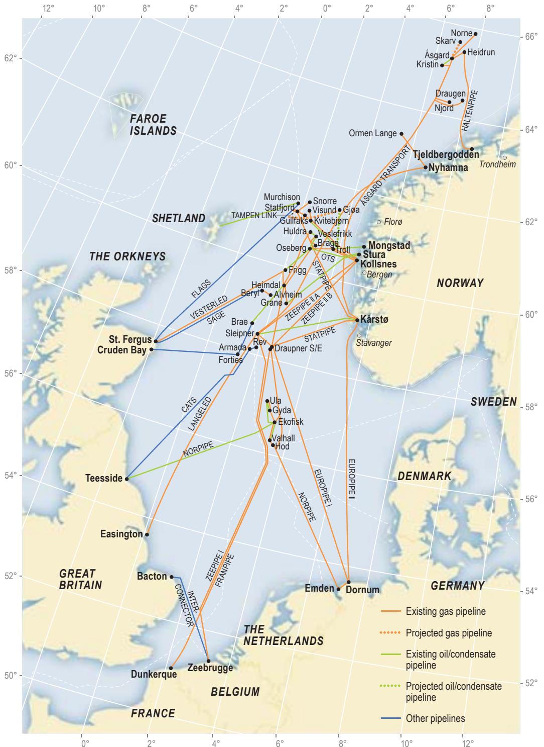
Figure 15.1 Existing and projected pipelines