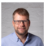
Arne Jacobsen Leader of Technology and coexistence